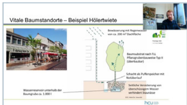
Tree locations in Hölertwiete, Hamburg.

In the discussion that followed, the speakers emphasized the need for many more pilot projects like the i.WET-Allee, which also need to be rolled out more quickly. This could provide an impetus for regulatory institutions to adapt currently inhibiting regulations to the requirements of blue-green infrastructures. To this end, the actors must leave behind the silo thinking in infrastructure planning and focus more on the interfaces between buildings and the external infrastructure.