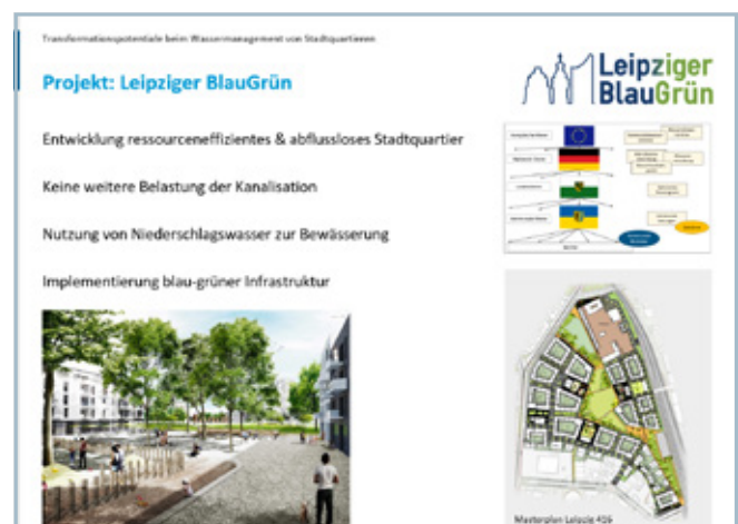
Leipziger BlauGrün – Blue-green district development in Leipzig.