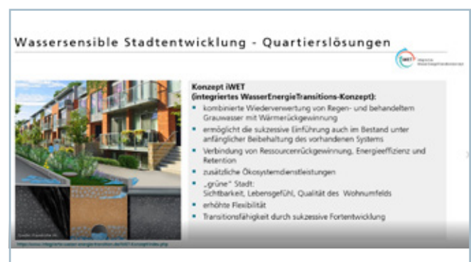
The i.Wet concept.

In summary, the speaker emphasized that windows of opportunity, such as depreciation cycles or renovation cycles for the integration of sustainable water management systems, must be recognized and used in order to react to the changes in the course of climate change by means of blue-green infrastructures, among other things. An innovative combination of decentralized and centralized, but also conventional and innovative elements in the treatment, storage and use of water is essential. This combination and introduction of new components requires the early involvement of all relevant actors and a consistent will for change in the local authorities and municipalities.